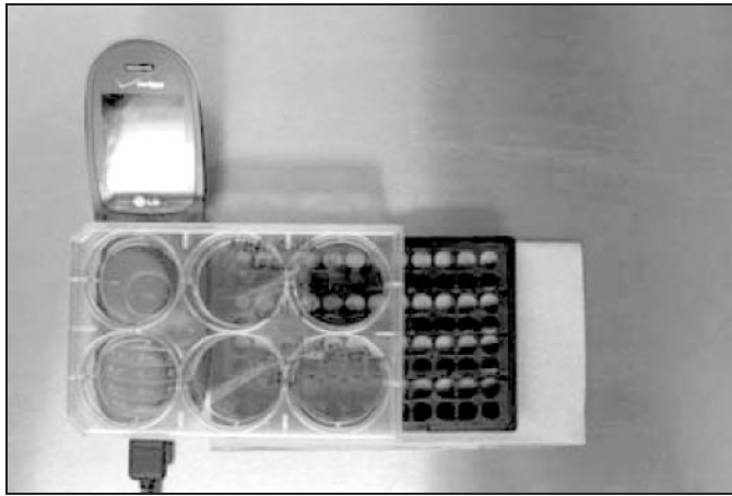
Figure 2: Exposure of Tissue Culture to Cell Phone Radiation (TopView)